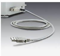
RS-232C/USB interface cable