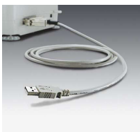
RS-232C/USB interface cable

*) Triangular weighing pan shape. Ø = diameter of the inner circle; the shaded area is completely available for use.